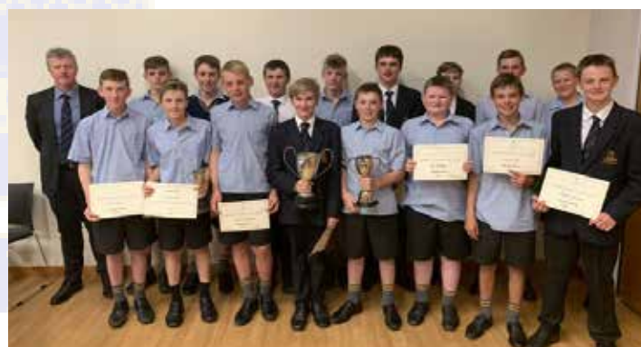
Sports Team of the Year 2019 Mountain Biking Team