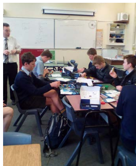
Circuits and Arduino programming