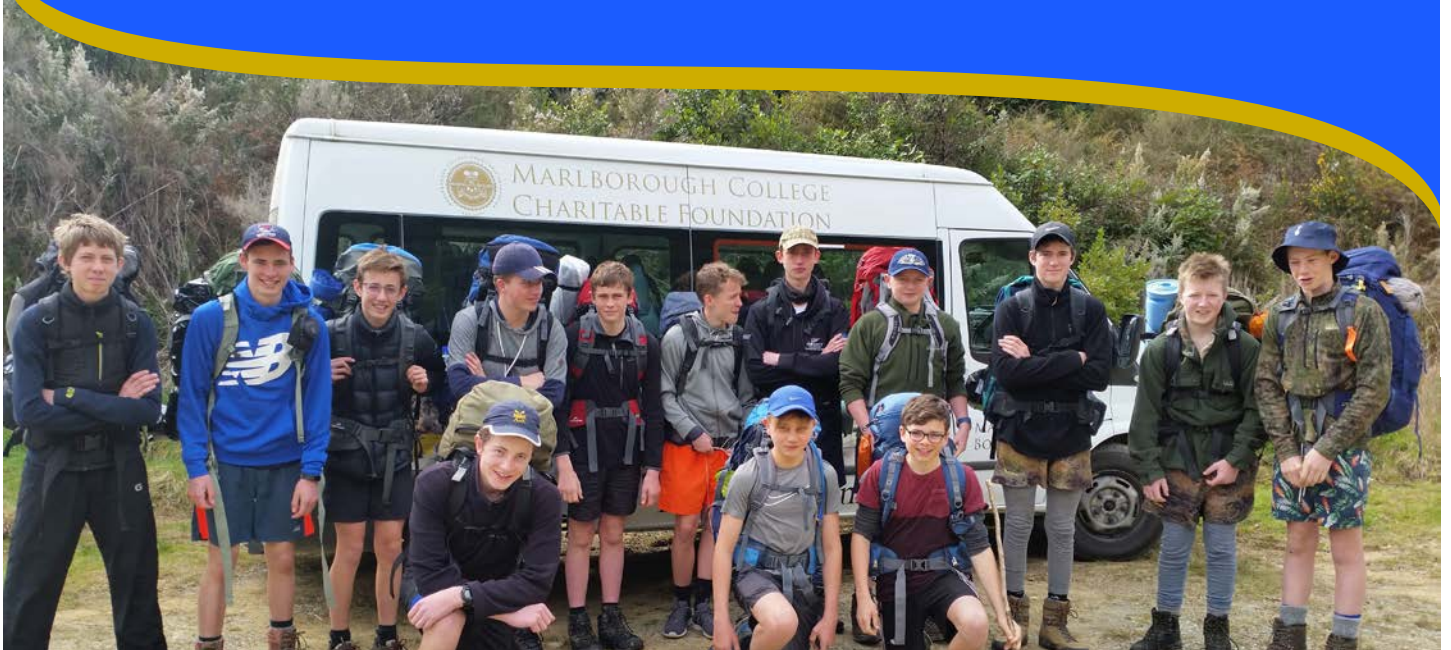
The Duke of Edinburgh's Award, Bronze - Trip to the Richmond Ranges