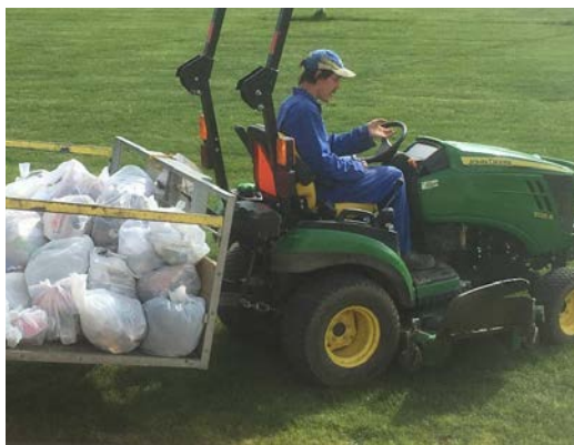
Rubbish picked up in the community by Year 10 students.

The terms' Skills for Life session, the Duke of Edinburgh camp, sport and arts opportunities, and the Year 10 Rotoiti Camp provided co-curricular and extra-curricular opportunities for students. We got very positive responses from community members regarding the environmental work done by year 10 and 13 students.