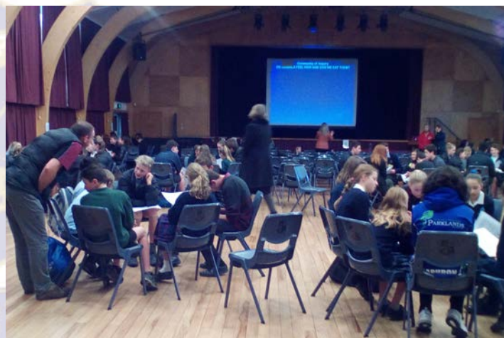
Junior Students at the Philosophy Conference