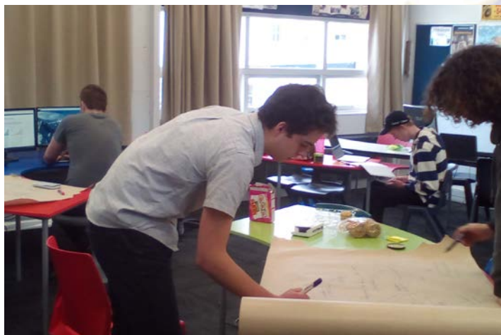
Students competing in the NZ Top Engineering Scientist Competition