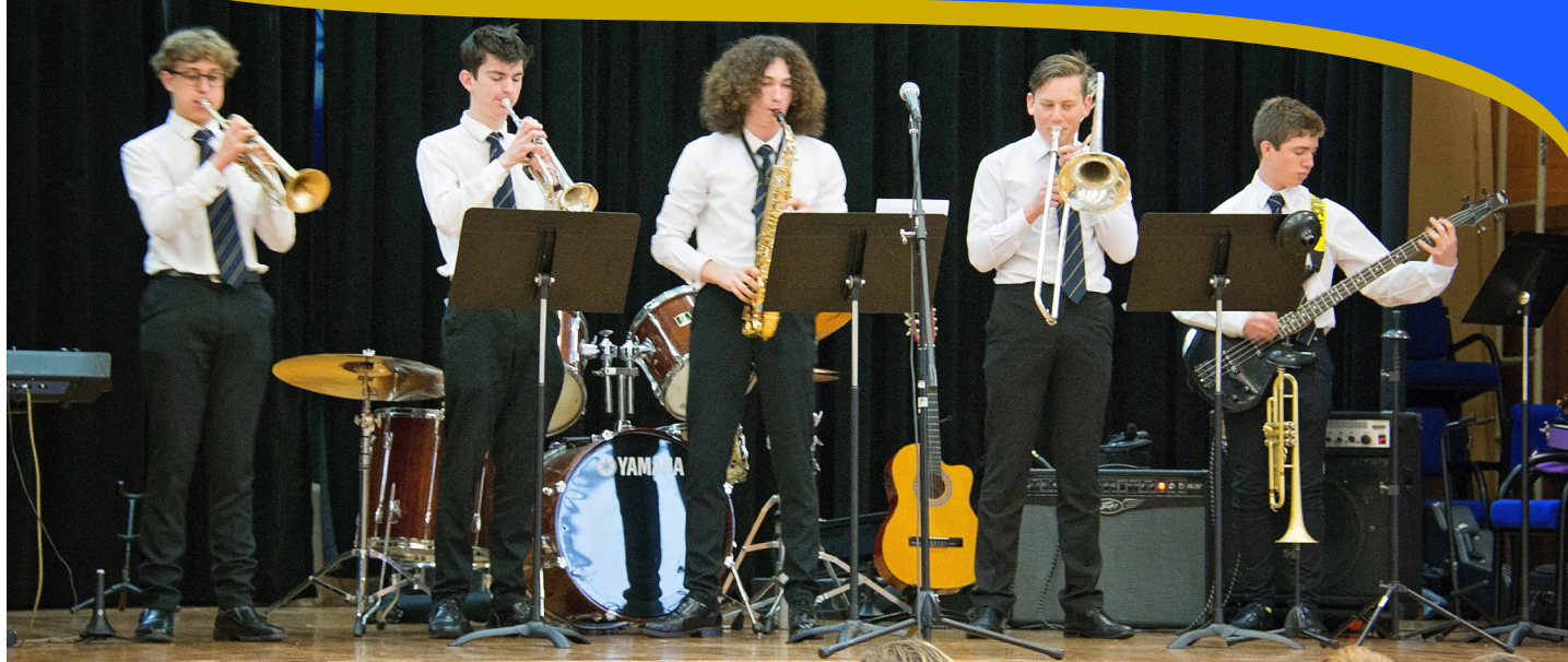
MBC Jazz Band