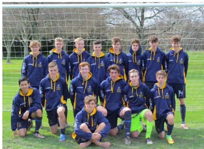
Top: Senior Football Team

Lots of info about school sport events is on the school app or school facebook page.