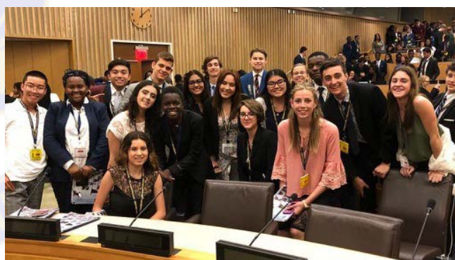
Global Leaders Conference in Washington