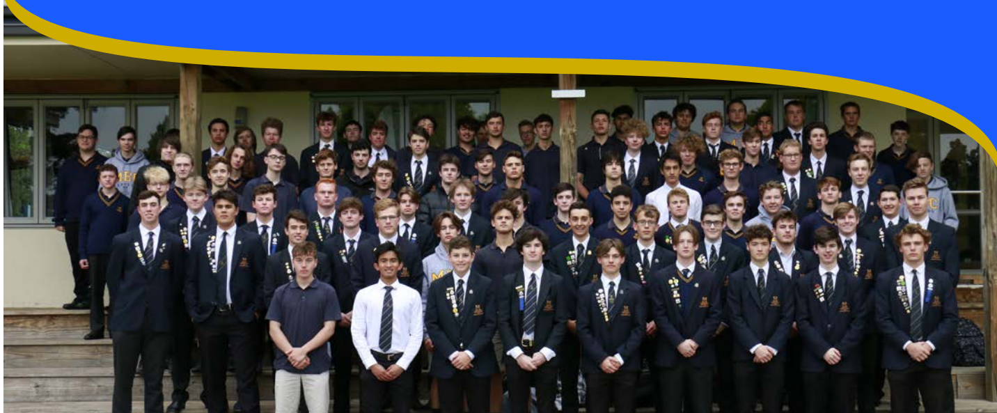
The Year 13 Graduating Class of 2018