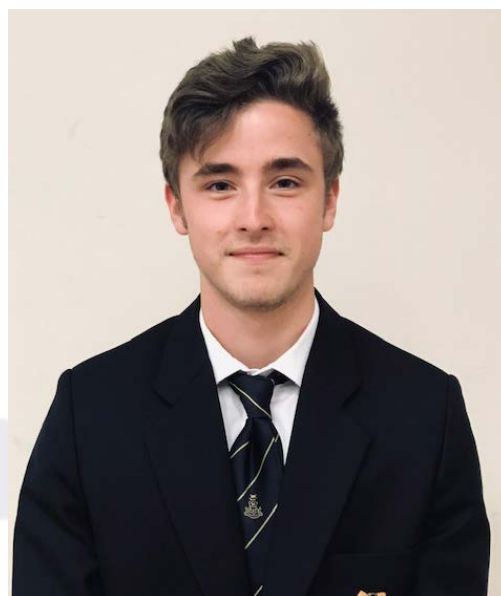
Sportsman of the Year 2018