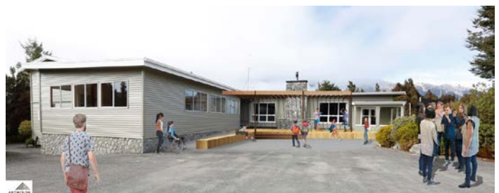
Front of Lodge