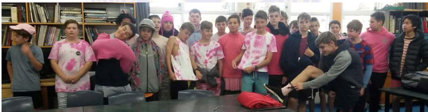
9CHD on Pink Shirt Day

'Stand Strong NZ' is a series exploring the issues around bullying and what's being done to reduce the harm.