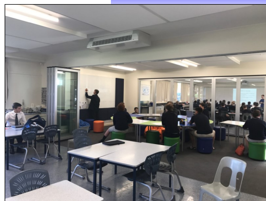
The Science Innovative Learning Environment in action