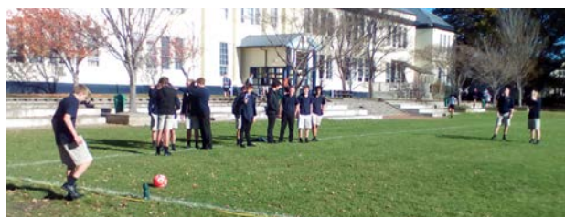
Above: Perfecting the football pass - does practice make perfect?

The teachers of the classes really enjoyed their time with the boys and were very impressed by their efforts. Well done to you all!