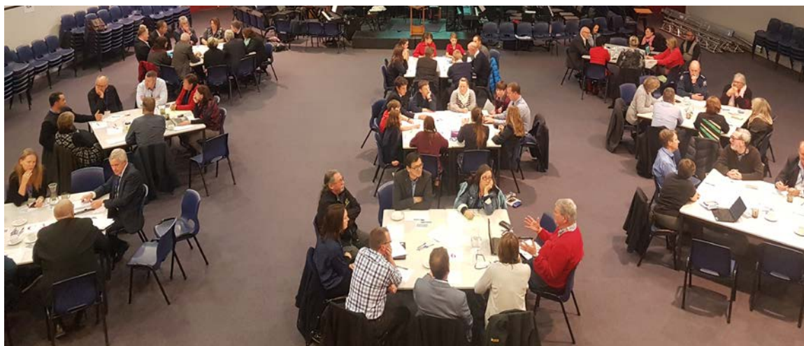
Community Leaders taking part in our initial workshop

The initial responses will be used to develop a base consultation document for wider consultation (including public meetings) in term 3. Much more information about the new school planning is available in our latest Co-location Newsletter Also...watch this space for the launch of our co-location website!