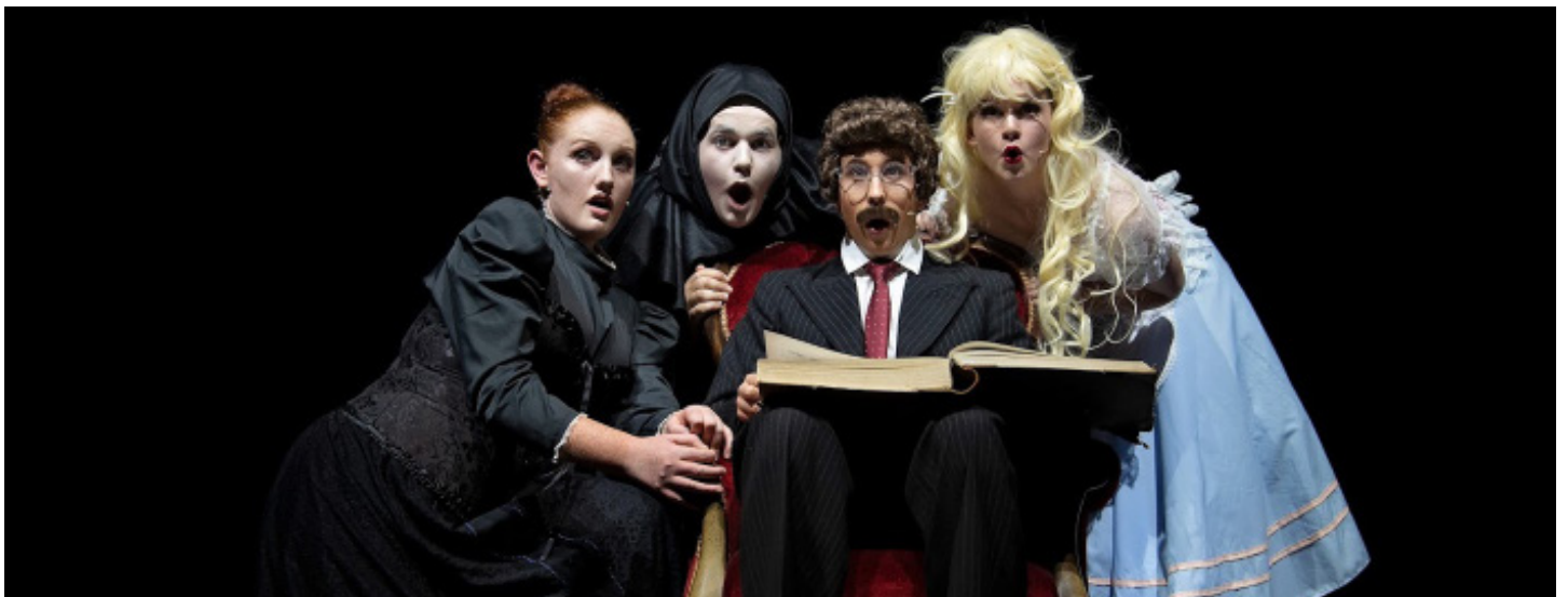
Young Frankenstein photographs